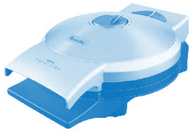
WM800B - Waffle Creations™